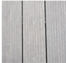
After two years