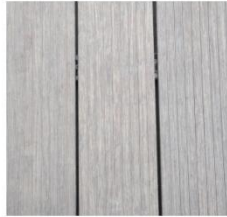
After two years